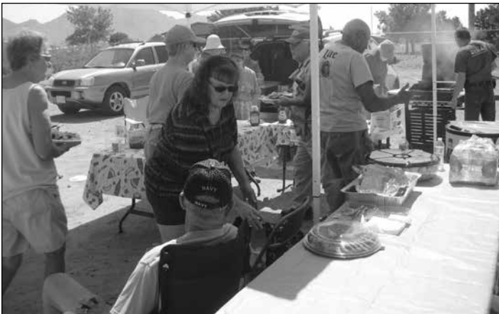
Visitors enjoy sharing time at 2013 Open House.

Generous contributions of wonderful items from our supporters, along with a high demand from buyers for those items, have led the Thrift Store to once again expand its store space. We have acquired adjoining space where Business Products used to be housed. We will hold a Grand Opening and Ribbon Cutting by the Chamber of Commerce on Thursday, October 2nd at 4pm. We would love to see you there. The book section has moved into this space and we also added room for larger furniture items and appliances. We now have a dedicated area for children's items as well as a pet department for pet-related merchandise.