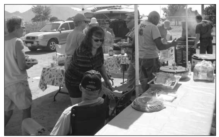
Visitors enjoy sharing time at 2013 Open House.

Safe Haven volunteers will be on hand to serve you refreshments, talk to you about the work we do, and to take you on a tour to meet our animal family. Mark your calendar and check the website for directions.